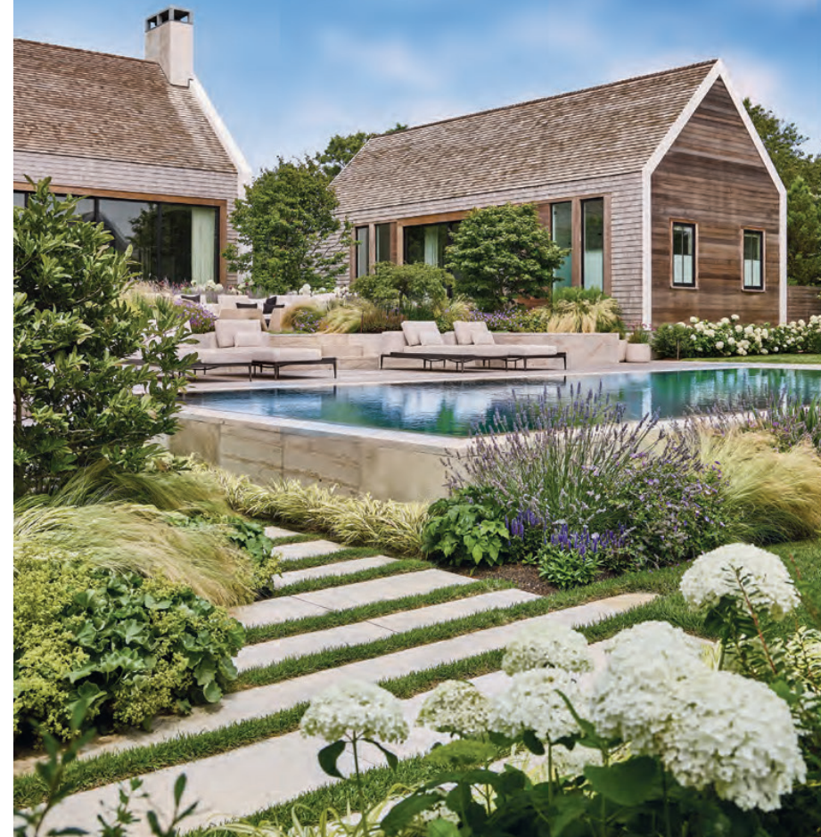
Workshop/APD used an infinity pool to tame an uneven landscape at its Courtyard House project in Nantucket, Massachusetts, featured in the firm’s recent monograph.