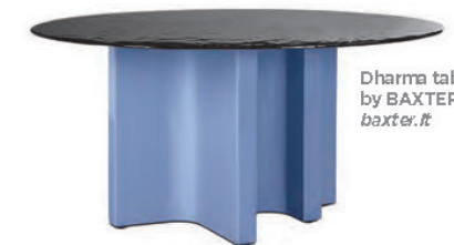
Dharma table by BAXTER; baxter.it