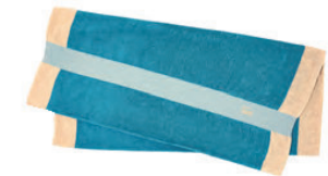
Beach towel by FRETTE; frette.com