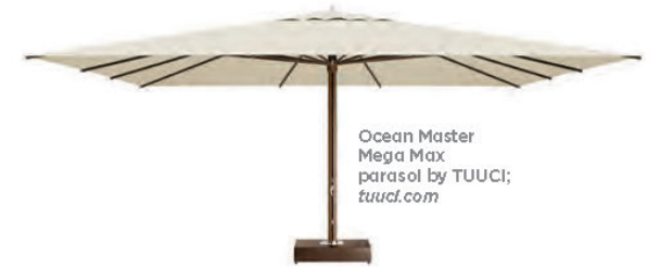
Ocean Master Mega Max parasol by TUUCI; tuuci.com