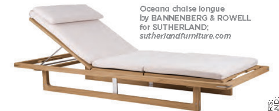
Oceana chaise longue by BANNENBERG & ROWELL for SUTHERLAND; sutherlandfurniture.com