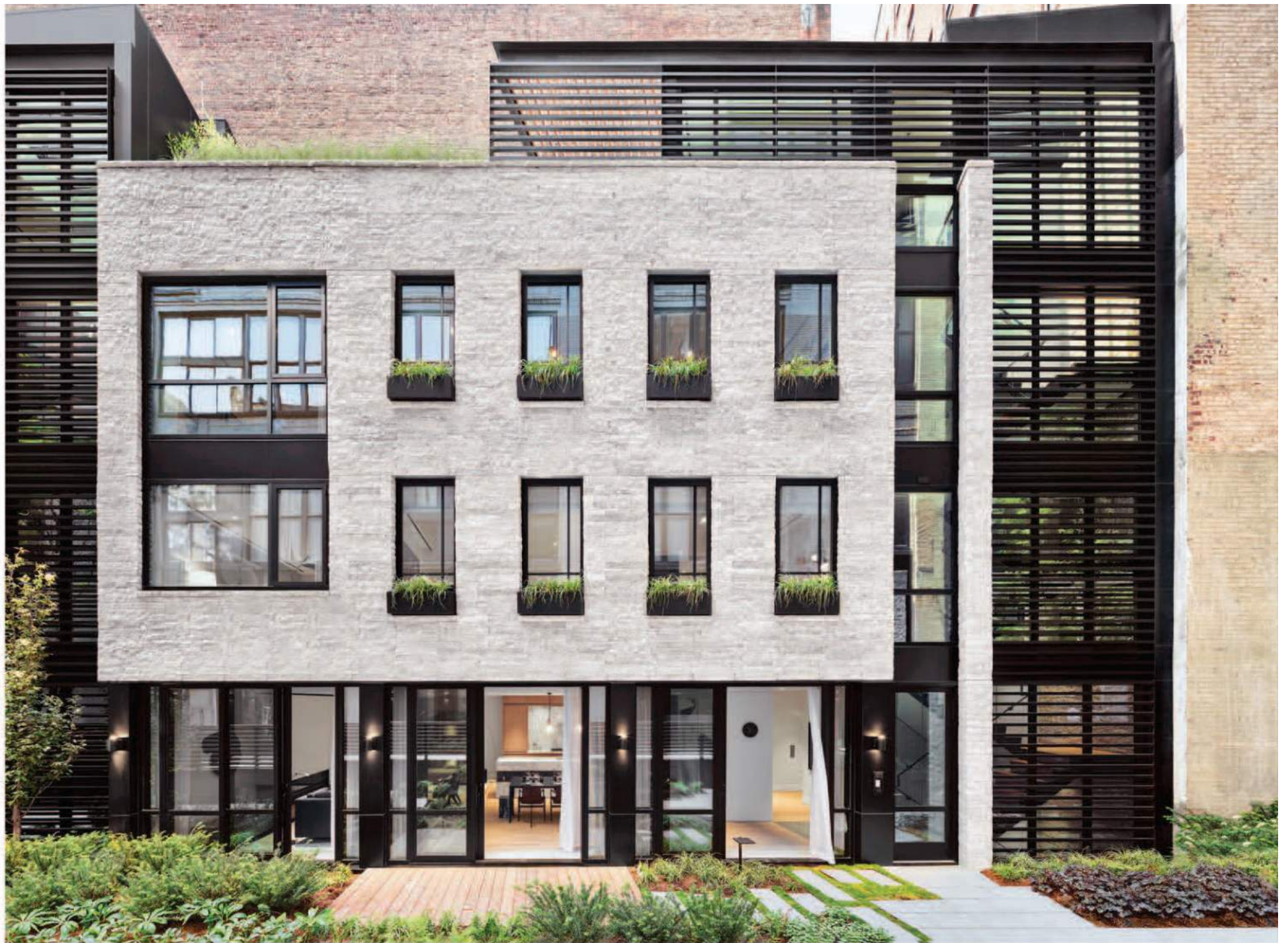
IN AND OUT LEFT, TOP TO BOTTOM: The penthouse floor is set up for entertaining; a welcoming terrace is shielded from above by a trellis which provides privacy but still allows light to come through. RIGHT: The façade of the building is beige, textured limestone, an homage to the original building's industrial past. The center core stairways are a dramatic focal point, lined with baguettes to create privacy and graphic flair.

The buildings were developed in two phases. For the first several years, the firm worked on the apartments in the main buildings. On the heels of that project, the second phase began: developing the mews garden and the adjacent townhouses and maisonettes. Originally, the building had five townhouses and eight maisonettes, and Workshop APD was tasked with converting it into two townhouses and three maisonettes. "The challenge was, how do you create something that is a luxury townhouse, but isn't traditional? What we did was transform the homes into vertical loft living." CONTINUED ▶