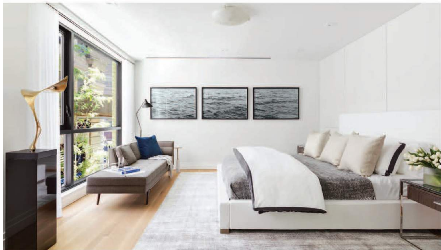
MASTER OF THE HOUSE ABOVE: The Master bedroom is a serene escape from the rigors of the day. The platform bed is from Restoration Hardware. BELOW: The master bath, clad in marble, has a spa ambiance. OPPOSITE: A cheerful girl's room is covered in Kandy vinyl wallpaper by Elitis.